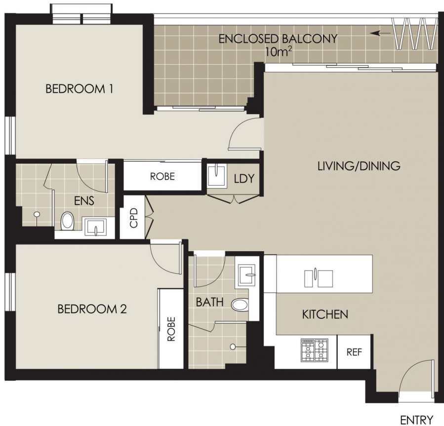
APARTMENT FLOOR PLAN