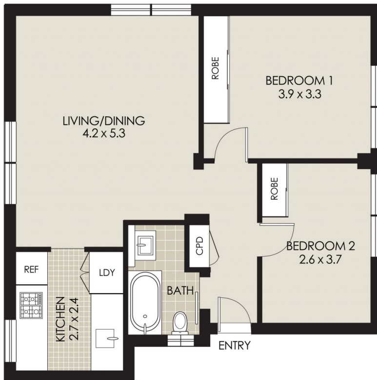
APARTMENT FLOOR PLAN