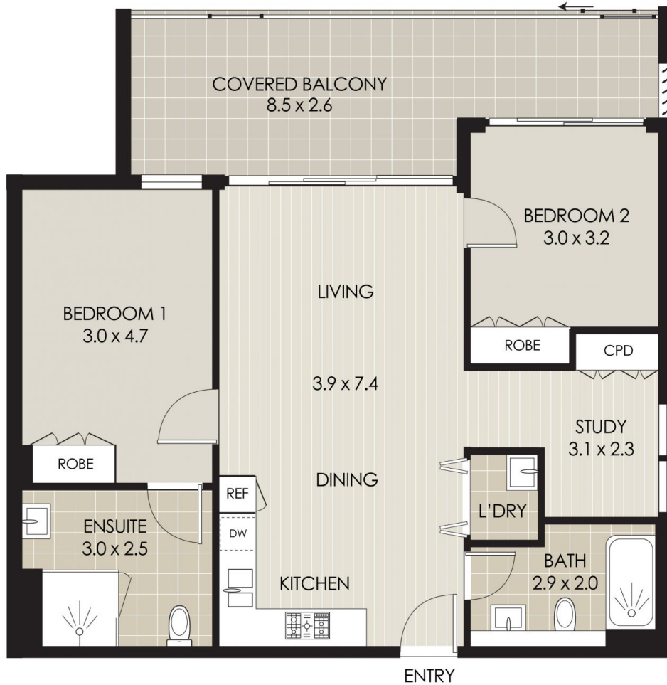
APARTMENT FLOOR PLAN - LEVEL 3